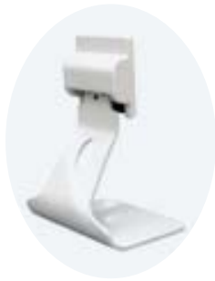
Desktop Stand 2) – Tilttable and VESA compliant mounting.