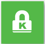
Kensington Lock Slot