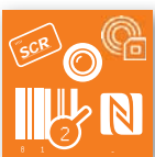
Data Collection 1)