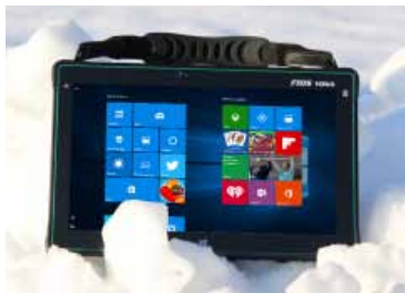
Rugged and Weatherproof. With mounted carry handle 3)