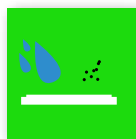
Water- and ingress protection