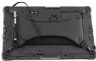
Pen and x-strap with pen holder 3)