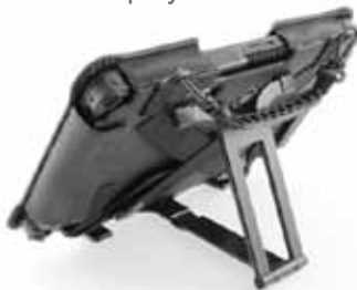
Carrying handle and case with x-strap, in display stand