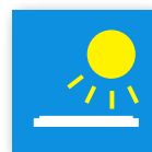
Sunlight readable screen