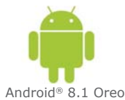
Android® 8.1 Oreo