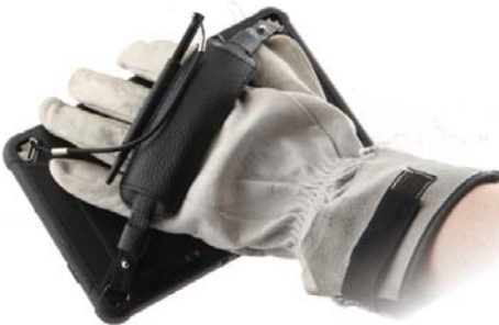
Easy to handle