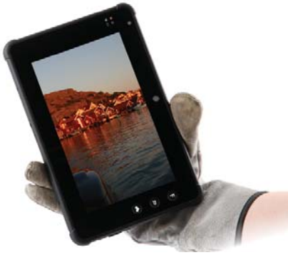
Clear bright screen, Gorilla Glass