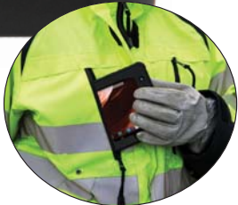
Fits in pocket!