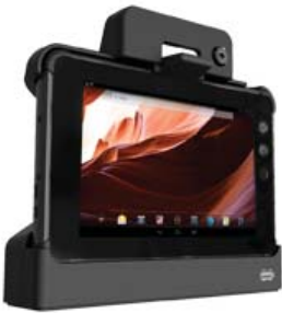
Vehicle- and Desktops cradles 2) with DC, USB, HDMI, Serial Port and Ethernet