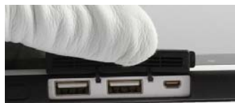
USB and microHDMI