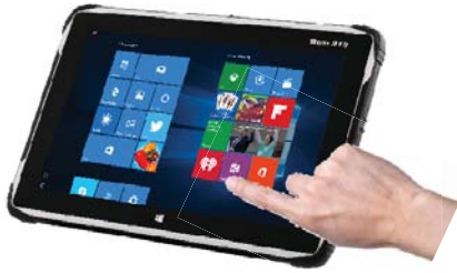
Capacitive multi touch screen