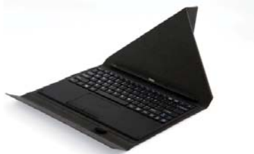
Unique keyboard/cover available as accessory