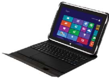
Magnet keeps the screen standing