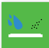
Protected against water and dust