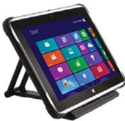
Table holder is available as an accessory