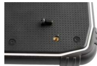
Prepared anchor points