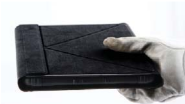
Slim design and light weight