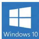
Windows 8® and Windows 10® compatible