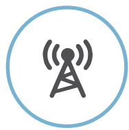
Smart Base Station