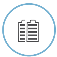
Dual Batteries Dual insurance