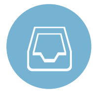
As solid as a rock