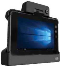
Vehicle cradle 3) with USB, HDMI, serial port and Ethernet