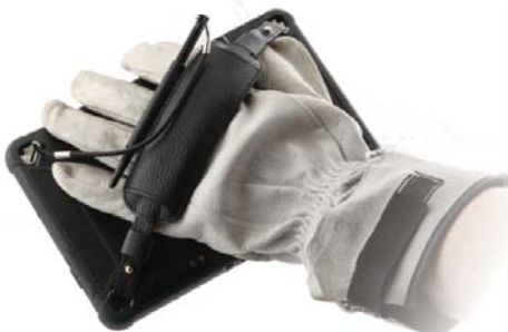
Easy to handle