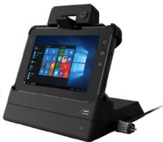
Desktop cradle 3) with USB, HDMI, serial port and Ethernet