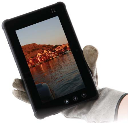
Clear bright screen