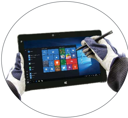
Withstands rain and dust, supports glove and stylus