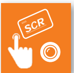
Readers & Cameras