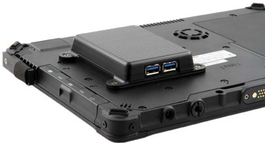
Expansion ready for the choice of modules 1)