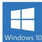
Microsoft® Windows® 10 Pro