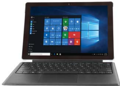
Keyboard Clip On 2)