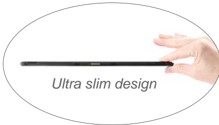
Ultra slim design