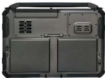
Dual battery for no power down time