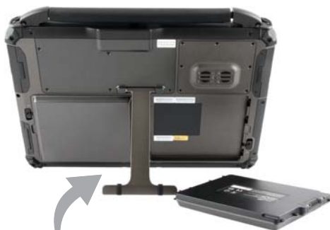
Integrated table top stand on back