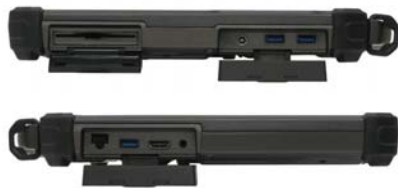
Ports under cover latches