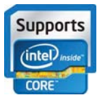
Intel quad core inside

For more information, please contact mail@forest-it.com