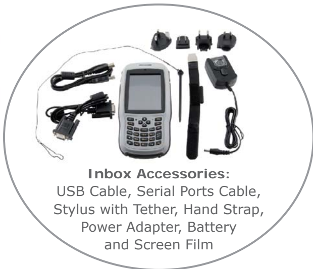
Inbox Accessories: USB Cable, Serial Ports Cable, Stylus with Tether, Hand Strap, Power Adapter, Battery and Screen Film