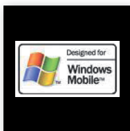
Windows Mobile 6.5