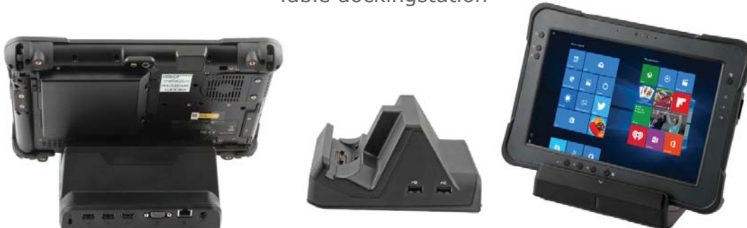
Table dockingstation 1)