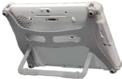
Handstrap and integrated tripod come as standard

SR13-M has a range of accessories, such as: