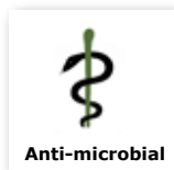
Anti-microbial Bacterial resistive enclosure in PC-plastics

The Medical Mobile Tablet has rubber damped corners, tempered glass and a reinforced frame that protects against bumps and knocks. Therefore, SR13M means high performance, versatility and efficiency in a slim, durable, bacteria-resistant package!