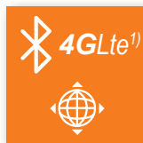
Multiple connectivity options