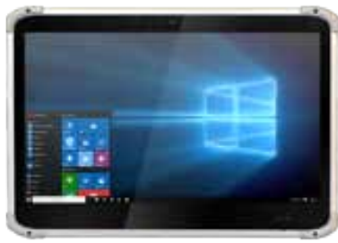
Reliability and performance in a bacterial-resistant package