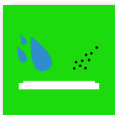
Protected against water and dust. IP53.