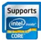
Intel® Core™ Broadwell i7 Intel® Celeron® Dual Core